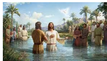
The Baptism of Jesus