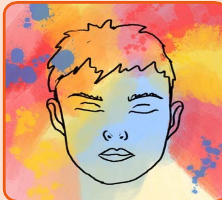
Wash of paint